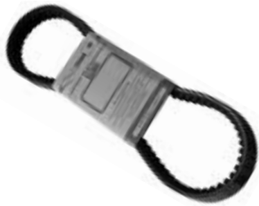
Tabella applicazioni cinghie di trasmissione e distribuzione